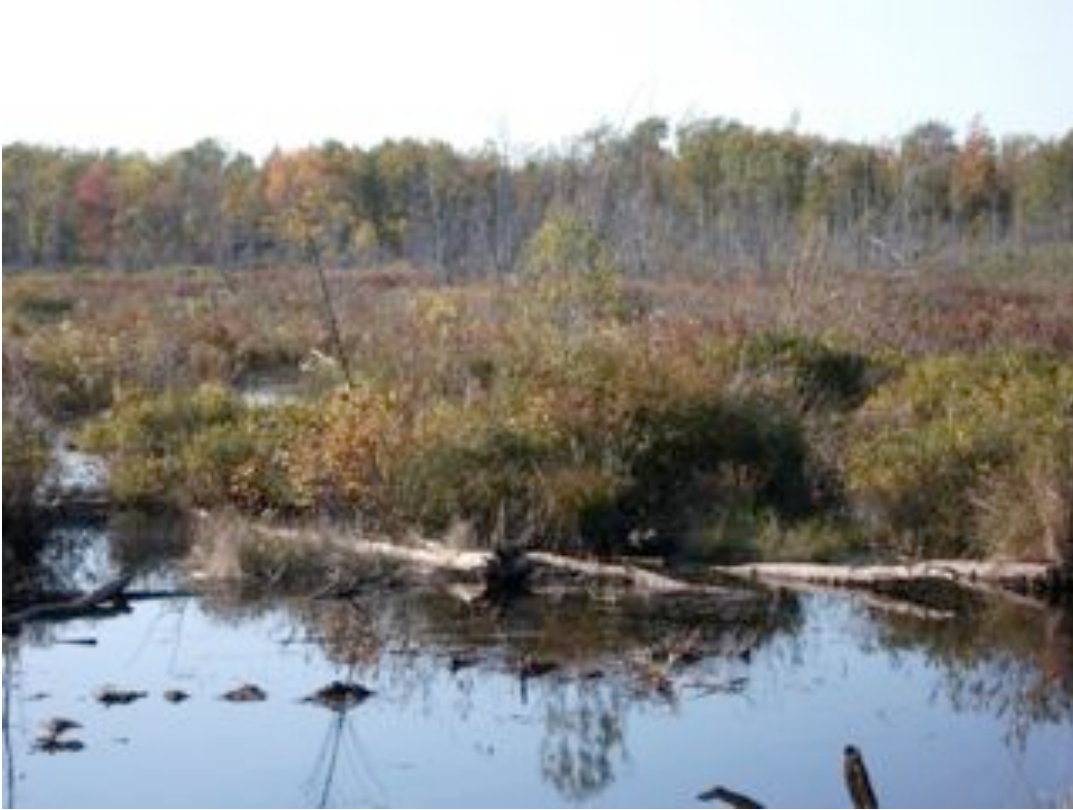
View from new blind to viewing tower.

WEB SITE - Our web site is in the process of being updated. Stay tuned for some wonderful changes. The newsletter will continue to be posted on the web, as well as emailed and mailed to non-computerites. You can still find us at www.friendsofmacgregor.org