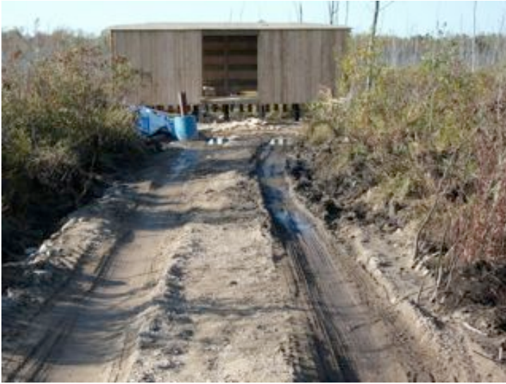
New blind will eventually be camouflaged with more reeds, etc.